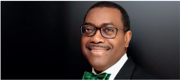
Dr. Akinwumi A. Adesina, President, the African Development Bank and Chairperson of ALN

With special focus on the first 1,000 days of a child's life, the initiative aims to influence and generate innovative investments towards nutrition and food security that will build a foundation for productive human capital in Africa.